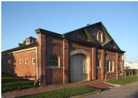
Pony Express Museum